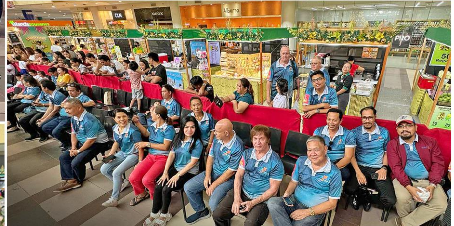
11062024 - RCDN Celebrate's National Children's Month with Children's Fun Day at Robinsons Dumaguete together with the Dumaguete City Social Welfare Department (CSWD), with the theme "Break the Prevalence; End the Violence; Protecting Children; Creating a safe Philippines!" Day Care pupils from Dumaguete City enjoyed an afternoon of fun games and prizes which is part of the week-long activity of CSWD.